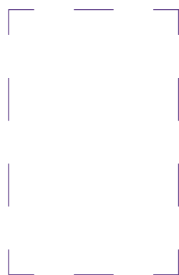
Digital Print 50 (h)mm x 32 (w) mm