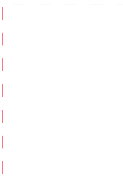
Laser Engraving (Large) 80 (h)mm x 55 (w) mm